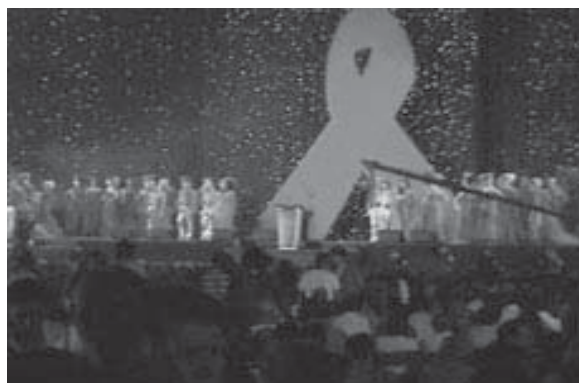
IAS Opening Ceremony