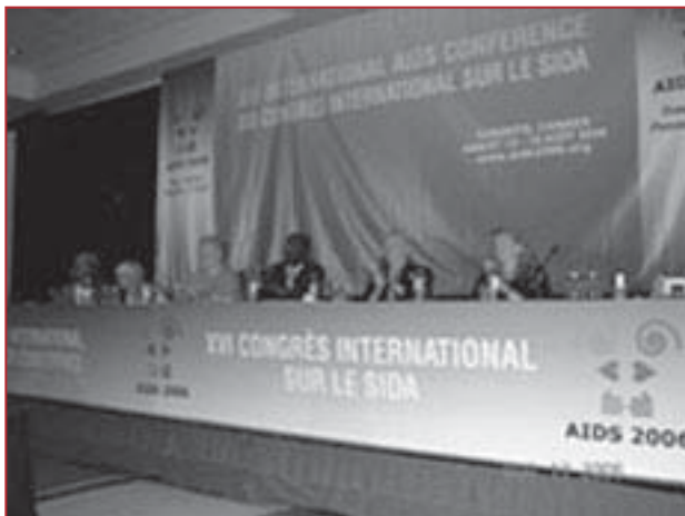
International AIDS Conference Panel