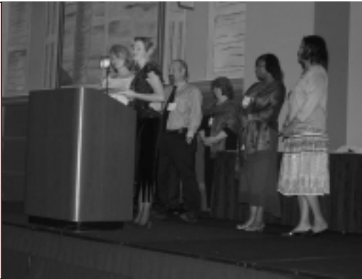
Houston Gulf Coast Chapter