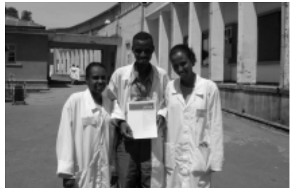
Nurses in Ethiopia proudly display JANAC.