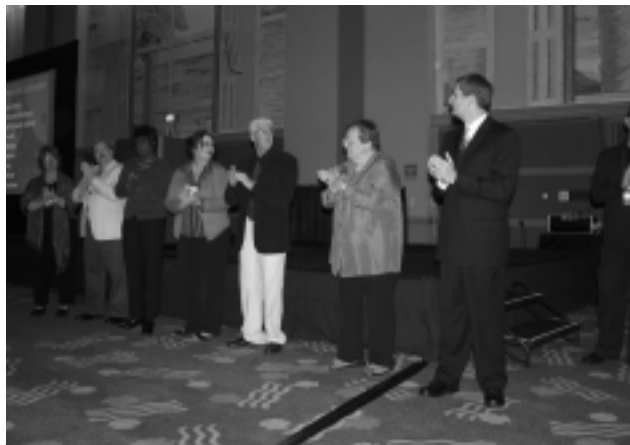
The 2005 18th Annual Conference Committee