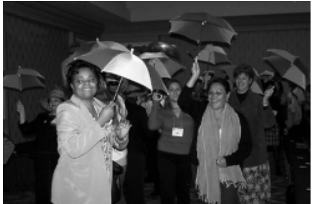
ANAC members have fun at a classic New Orleans Jazz Funeral Procession.