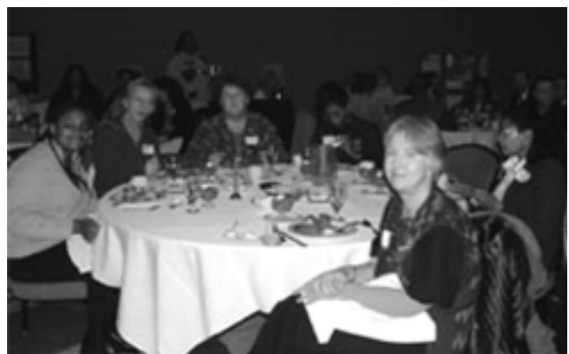
Members of the Southeastern Michigan Chapter enjoy dinner at a conference held by the chapter in December 2004