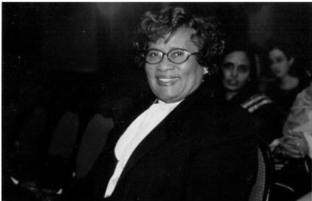
Dr. Joycelyn Elders prepares to deliver her address "HIV Prevention: Strategies to Ensure a Global Future"

is the leading event in HIV/AIDS nursing. The 2004 Conference, held in New Orleans from November 15-18, included Keynote Speaker Dr. M. Joycelyn Elders, outstanding plenary speakers and the annual Awards Ceremony. The following two pages of photographs show conference highlights and activities.