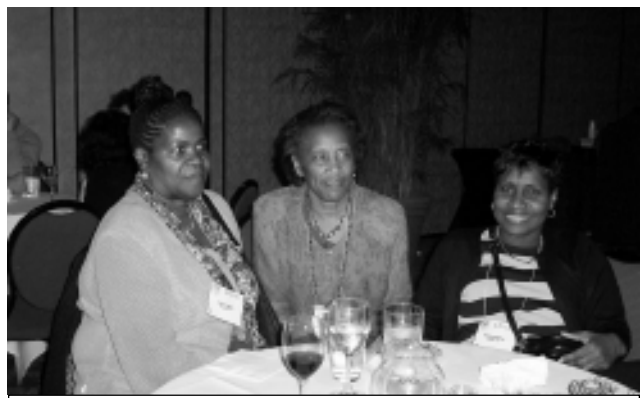
ANAC members in attendance at the Chapter Leadership session